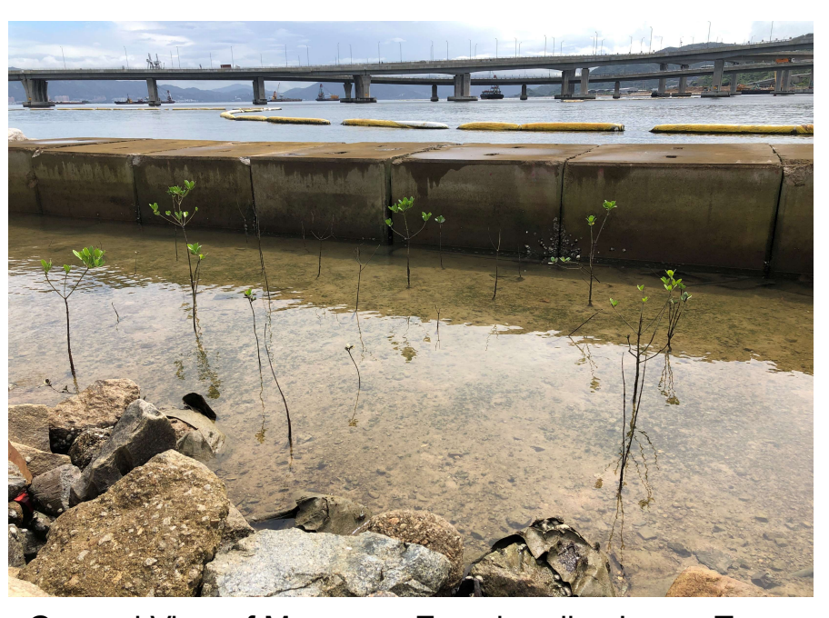
General View of Mangrove Eco-shoreline Lower Terrace