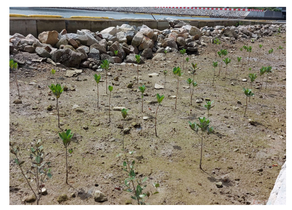
General View of Mangrove Eco-shoreline Upper Terrace